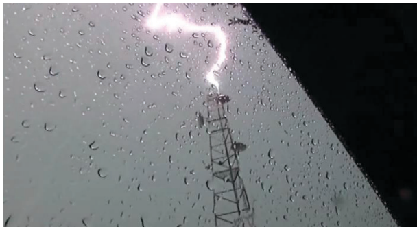
Figure 2: Lightning strikes a communications tower.

Check NOAA Weather Reports: Prior to beginning any outdoor work, employers and supervisors should check NOAA weather reports ( weather.gov ) and radio forecasts for all weather hazards. OSHA recommends that employers consider rescheduling jobs to avoid workers being caught outside in hazardous weather conditions. When working outdoors, supervisors and workers should continuously monitor weather conditions. Watch for darkening clouds and increasing wind speeds, which can indicate developing thunderstorms. Pay close attention to local television, radio, and Internet weather reports, forecasts, and emergency notifications regarding thunderstorm activity and severe weather.