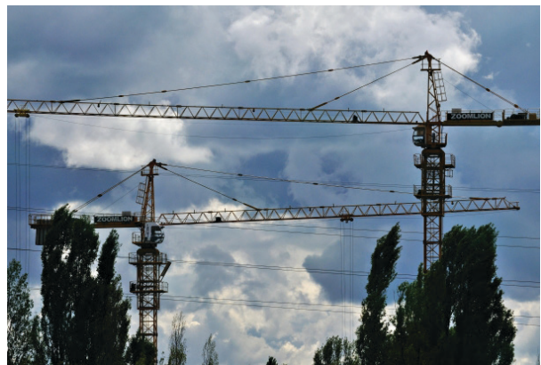
Figure 3: Cranes are especially vulnerable to lightning.

Employers should also post information about lightning safety at outdoor worksites. All employees should be trained on how to follow the EAP, including the lightning safety procedures.