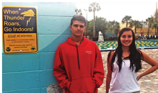
Figure 4: Preparedness reduces lightning risks.

An employer's EAP may include lightning warning or detection systems, which can provide advance warning of lightning hazards. However, no systems can detect the "first strike," detect all lightning, or predict lightning strikes. NOAA recommends that employers first rely on NOAA weather reports, including NOAA Weather Radio All Hazards: www.nws.noaa.gov/nwr .